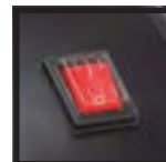
Easy reach on/off switch