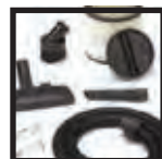
Accessories for wet/dry messes